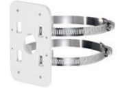
KMX-HA152 Pole Mount